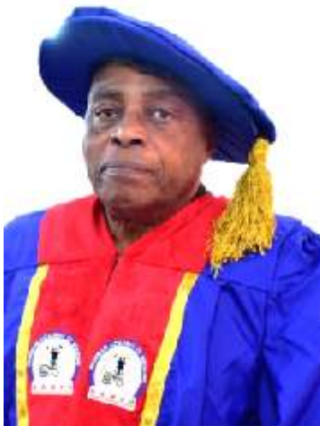
MEMBER, BOARD OF TRUSTEES