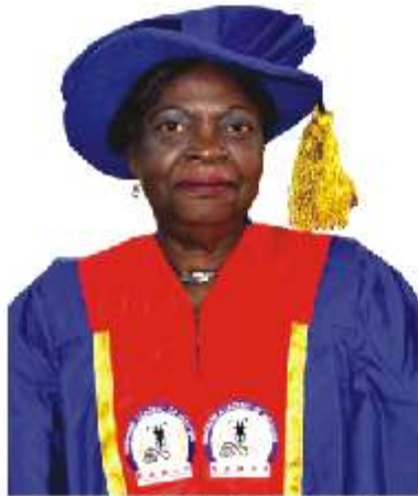
MEMBER, BOARD OF TRUSTEES