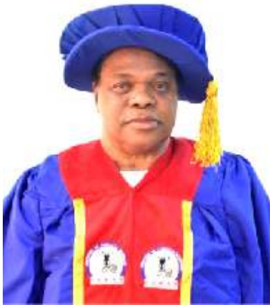
MEMBER, BOARD OF TRUSTEES