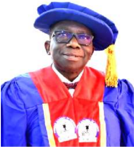
MEMBER, BOARD OF TRUSTEES