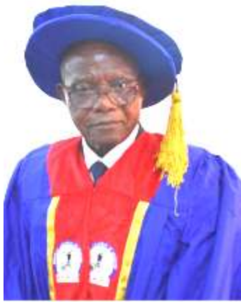
MEMBER, BOARD OF TRUSTEES