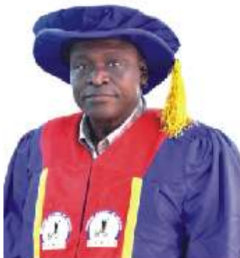
MEMBER, BOARD OF TRUSTEES