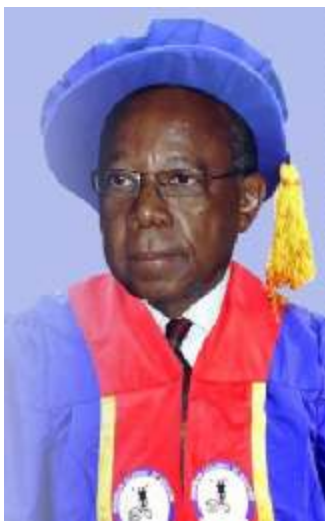
MEMBER, BOARD OF TRUSTEES

Focus in clinical and academic career largely on Reproductive health, particularly Prevention of Mother to Child Prevention of HIV and the prevention of Cervical Cancer and unsafe abortion. He has published over 230 articles in peer-reviewed journals and books on Oncology, Abortion, HIV/AIDS and Perinatal medicine. He is a passionate advocate for Reproductive Health and has received a number of awards and fellowships for work in this area, such as an honorary Doctor of Science degree from the University of Sunderland. He is an adjunct Professor at Northwestern University in Chicago.