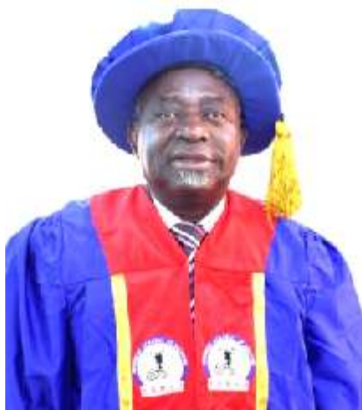
SECRETARY, BOARD OF TRUSTEES