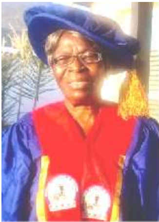
MEMBER, BOARD OF TRUSTEES